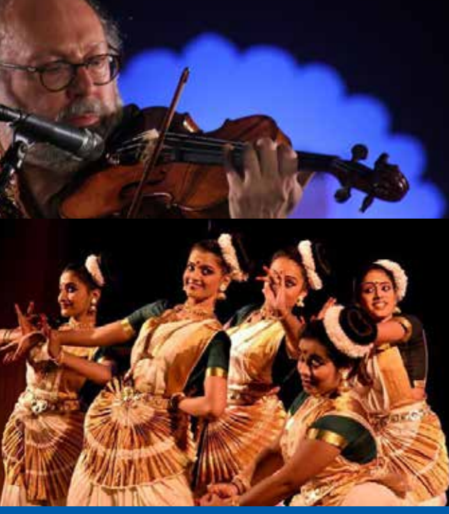
DIAF Childrens' Educational Tour